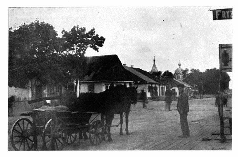
הרחוב הראשי לפני הדליסה הגדולה