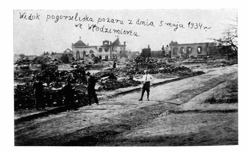
הוועדה הממשלתית להערכת נזקי הדליקה ב־1934