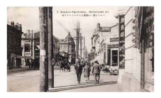
Russian and Chinese signs shared space on Kitaiskaya (Russian for "Chinese") Street, now Central Street, in the foreigners' district of early Harbin. Vintage postcard