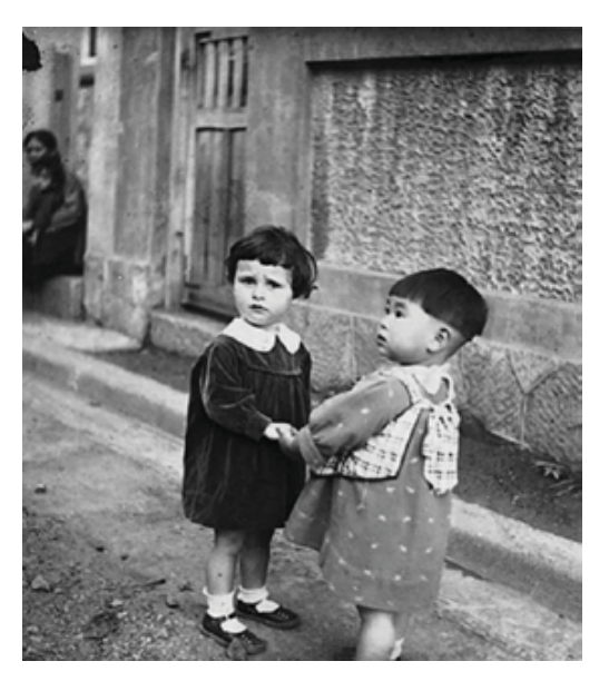
This iconic portrait of two girls, one Chinese and one Jewish, dates from about 1922.