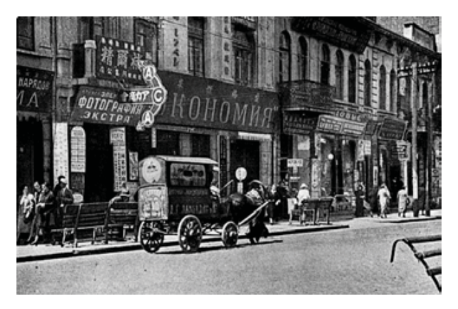
A horse and wagon passes Slutzky's Economy Store circa 1925. Due to a harsh climate and muddy roads, horse-drawn wagons and carriages remained an important form of transportation in Harbin in the 1920s and 1930s.