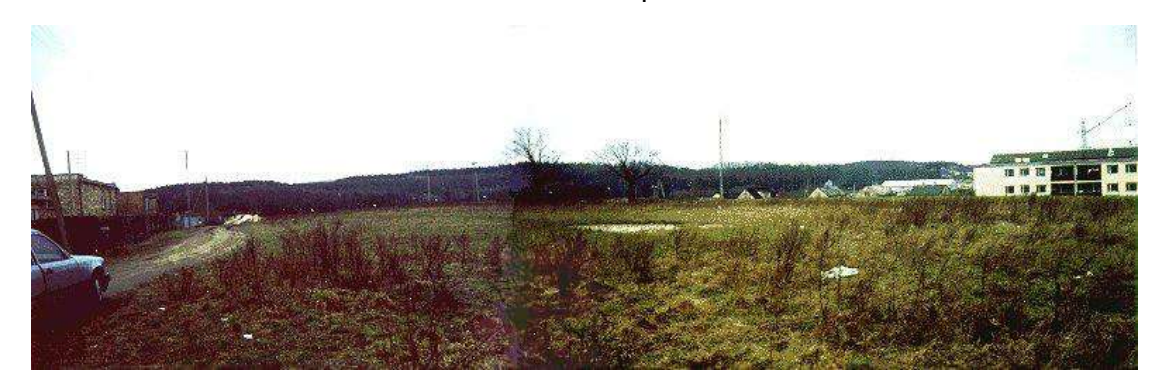
The old cemetery in 1989

In 1939 some estimates say that almost 4,000 Jews lived in Gostynin, though a more reliable number is 2,269. They suffered the same fate as thousands of other Jewish Communities during the Holocaust. When the German army entered the town in September 1939, there were mass arrests of Jews and Jewish property was looted and destroyed. The synagogue, which had been rebuilt in 1899 after a fire, was ordered dismantled so that the wood could be used for fuel for the houses of new German inhabitants of the town. Exorbitant fines were levied by the Nazis against the Jewish Community. In January 1941 a Ghetto was set up and approximately 3,500 Jews from Gostynin and the nearby town of Gabin (Gombin) were forced to live in the Gostynin Ghetto and were employed in laundering and tailoring workshops. From August 1941 many people were gradually moved to the Konin Concentration Camp. Sources report that the Ghetto was liquidated on April 16-17, 1942 with 2,000 Jews being taken to the Chelmno death camp. However some were probably taken to the Łodz Ghetto and the Konin Concentration Camp.