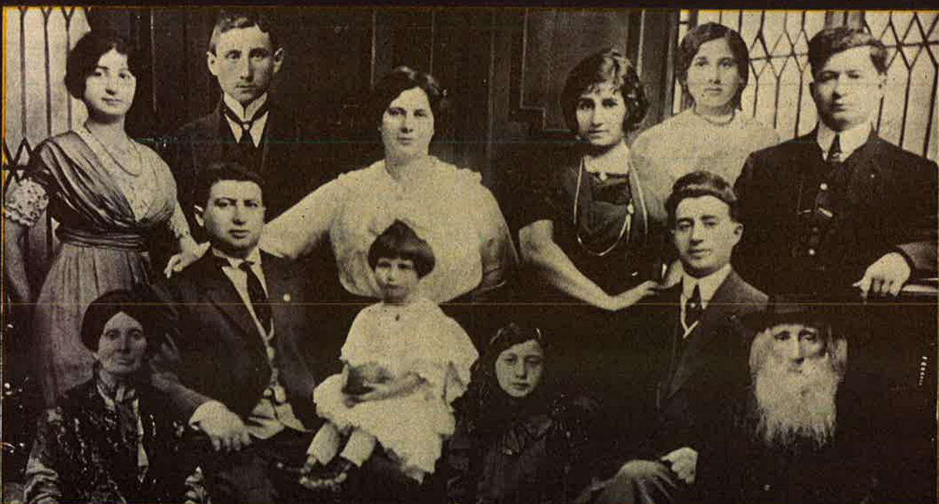
Family portrait: A montage of Koch's mother's family. In the lower corners are his maternal grandparents.