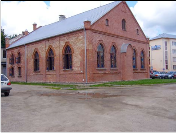
The red shul of Jonishkis