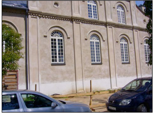
The white shul of Jonishkis

Over the years I've had intermittent contact with Cliff, but we'd never met. We greet one another with warmth and mixed emotions. Under different historical circumstances, all the descendants might have grown up in Zhager or known one another's families. Although the shuls are beautiful structures, of heritage interest, they are unlikely to be used as synagogues again: The Jewish community of Joniskis, like those in other areas of Lithuania, ceased to exist after 1941.