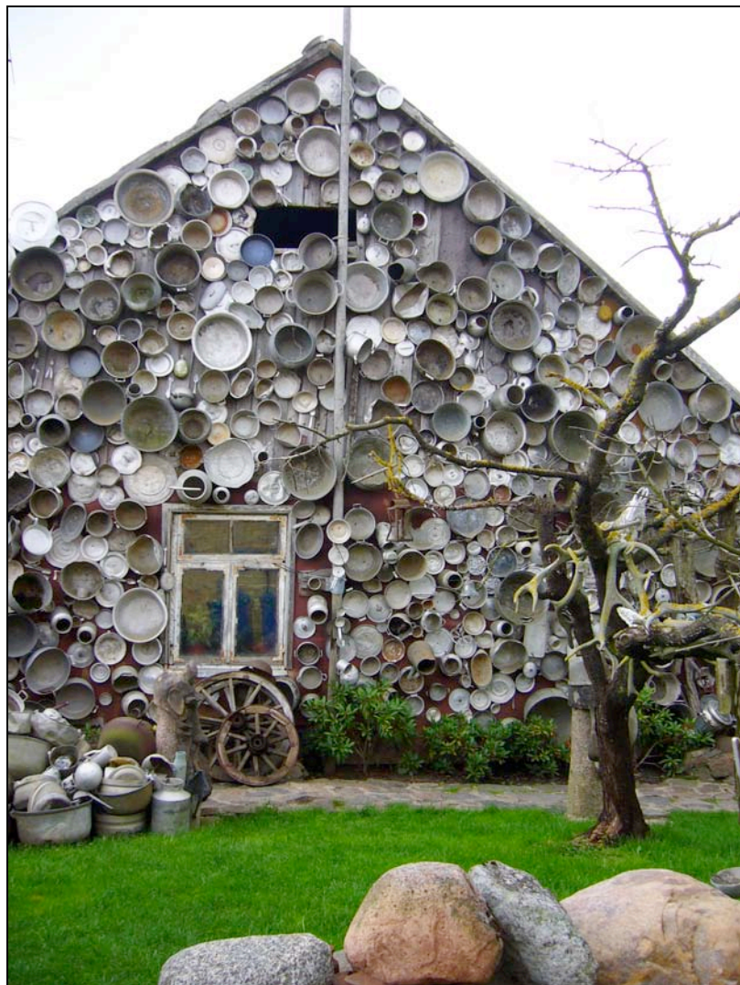
House of the pots and pans