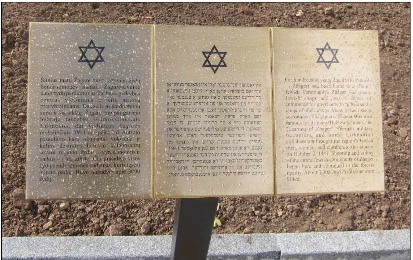
The plaque in Lithuanian, Yiddish and English