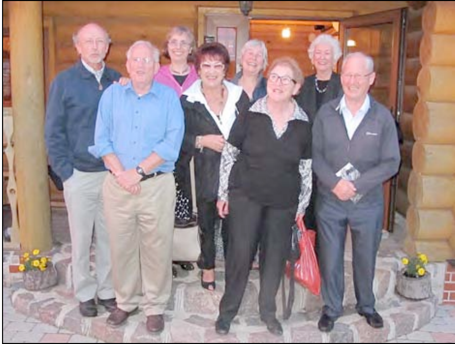
Some of the descendants