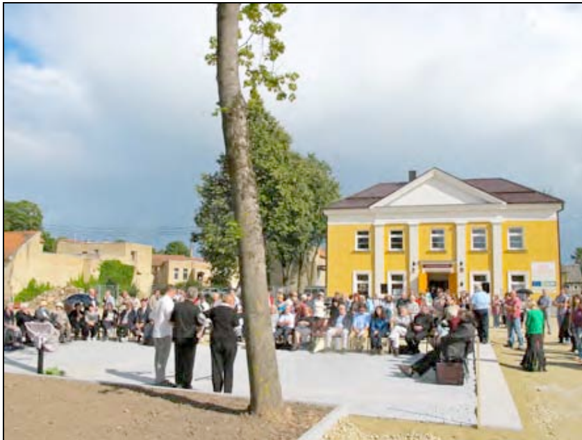
The Culture house in Zagare

The weather is unpredictable: midsummer showers alternate with shafts of sunlight breaking through threatening clouds. Will heavy rain will hold off until the plaque has been unveiled?