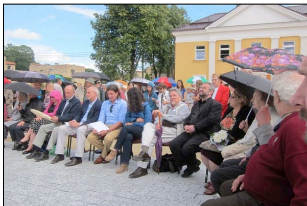
People in Zagare town square