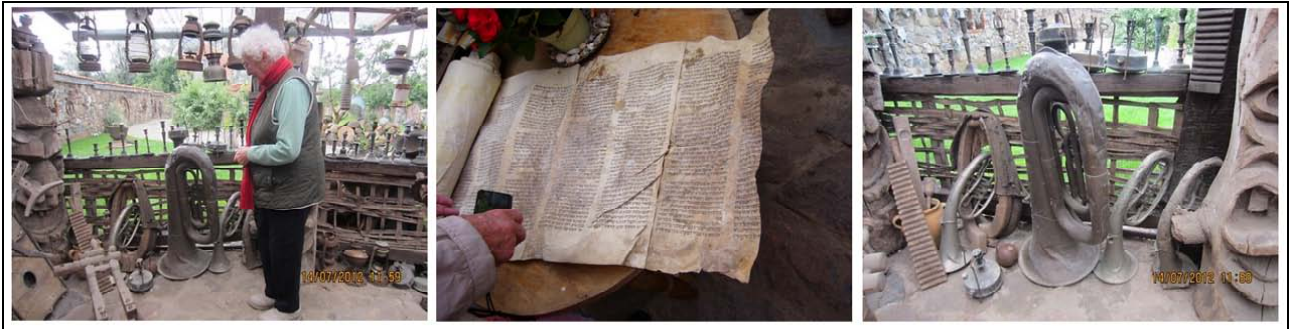
Torah and instruments

machine stands. She then begins to read from the half-destroyed Torah the story of the Jews' escape from Egypt.