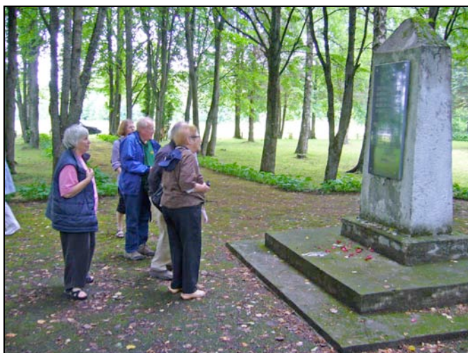
Mass grave, Naryshkin Park, Zagare