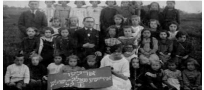
Photo of Orla School