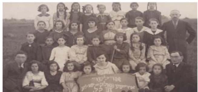
Photo of Orla School