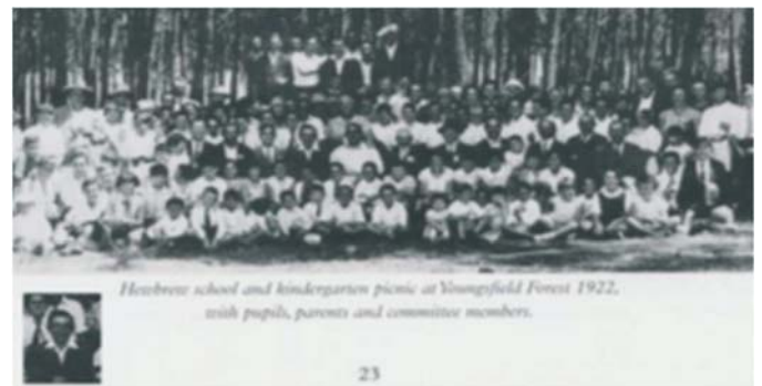
Hebrew School Picnic, 1922