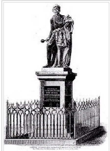
Monument of Hetman Stanisław Jan Jabłonowski erected by grateful inhabitants of Lwów.

He participated in the War with Sweden during The Deluge, then with the Cossacks and Muscovy. He took part in the Chocim campaign of 1673 and participated in the Vienna expedition of 1683. He led the right wing of Polish cavalry forces at the Battle of Vienna. He also stopped