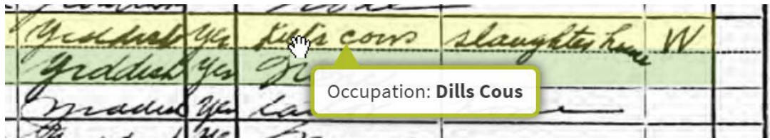
Figure 3 Ancestry's rendition of M. W. Rosenstein's occupation. "Kills Cows" is interpreted as "Dills Cous."