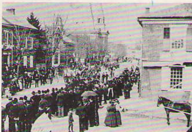
Original Municipal Building