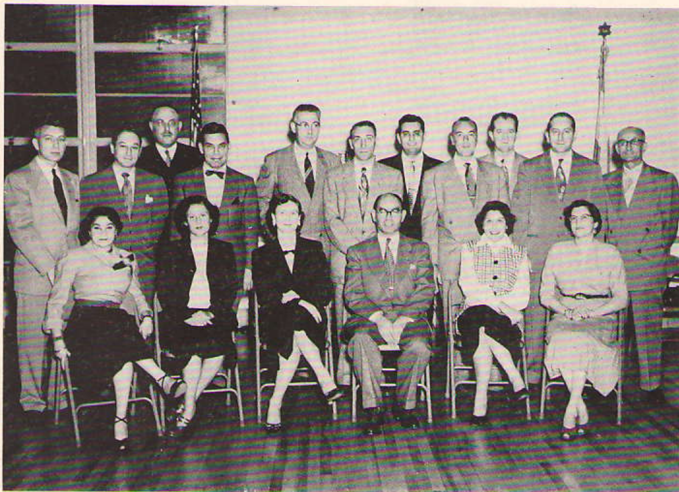
EXECUTIVE GROUP DEDICATION COMMITTEE