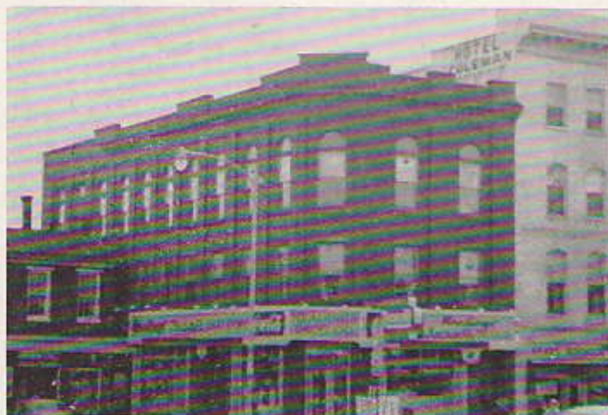
Wollner Building, Market Street