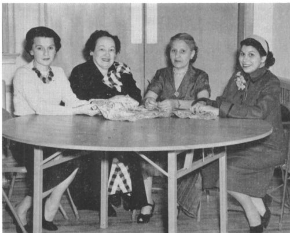
BUILDING COMMITTEE From OHEV SHOLOM AUXILIARY-HADASSAH CHAPTER