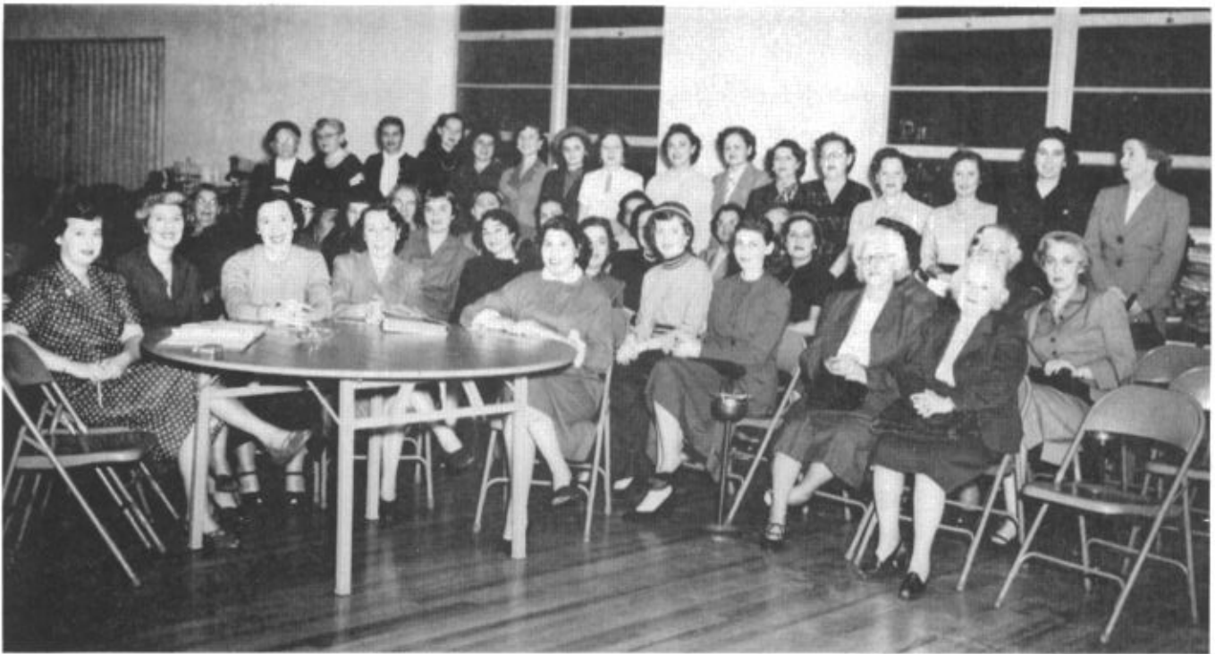
OHEV SHOLOM AUXILIARY-HADASSAH CHAPTER

A dream come true! That is what the completion and dedication of the Lewistown Jewish Community Center means to our current generation of Lewistown Jewry. But the fulfillment of this dream was not a miracle — the culmination of this important project was the result of years of united zeal, enthusiasm and sacrifice — both men and women working side by side — and now our new Center is a reality.