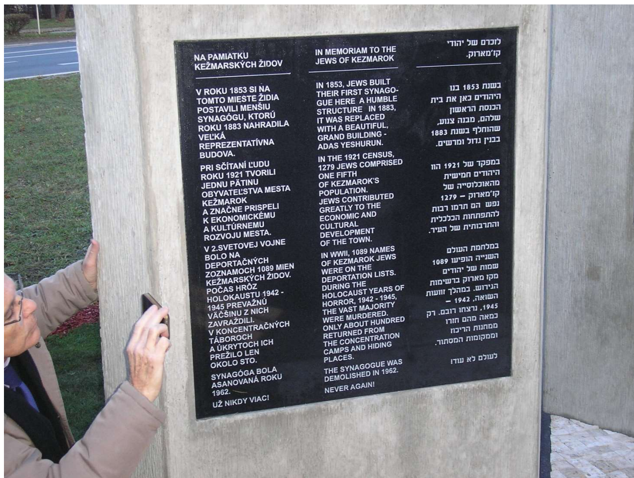
Kezmarok memorial 1

V ROKU 1853 SI NA TOMTO MÍSTĚ ŽIDIA POSTAVILI MENŠÍU SYNAGÓGU, KTORÚ ROKU 1883 NAHRADILA VEL'KÁ REPREZENTATÍVNA BUDOVA.