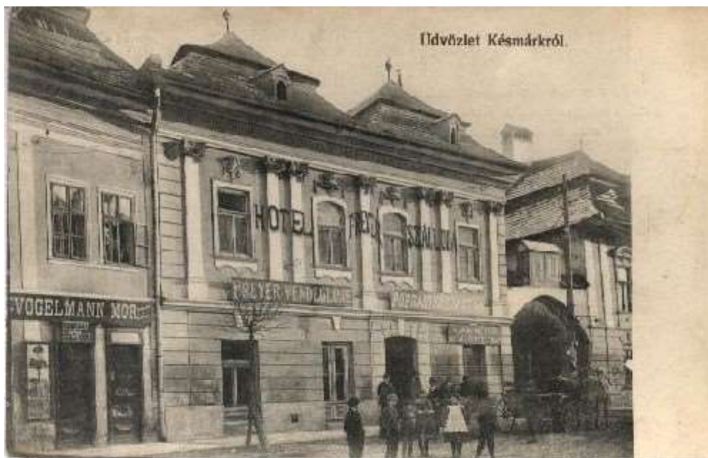
4 Picture of Store (Left)