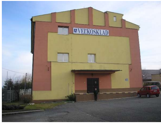
Figure 13- HUNCZDORF-FORMER SHUL BUILDING