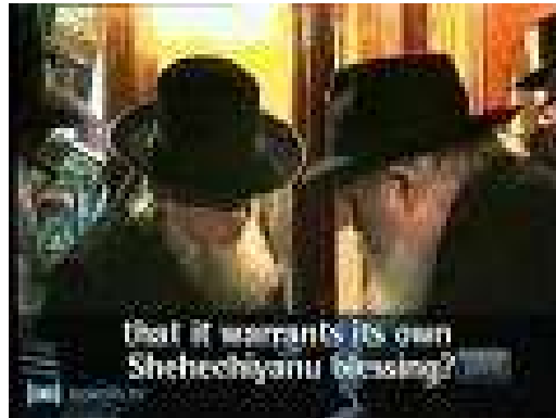
Figure 23-Kezmarker Rav with Lubavitcher Rebbe