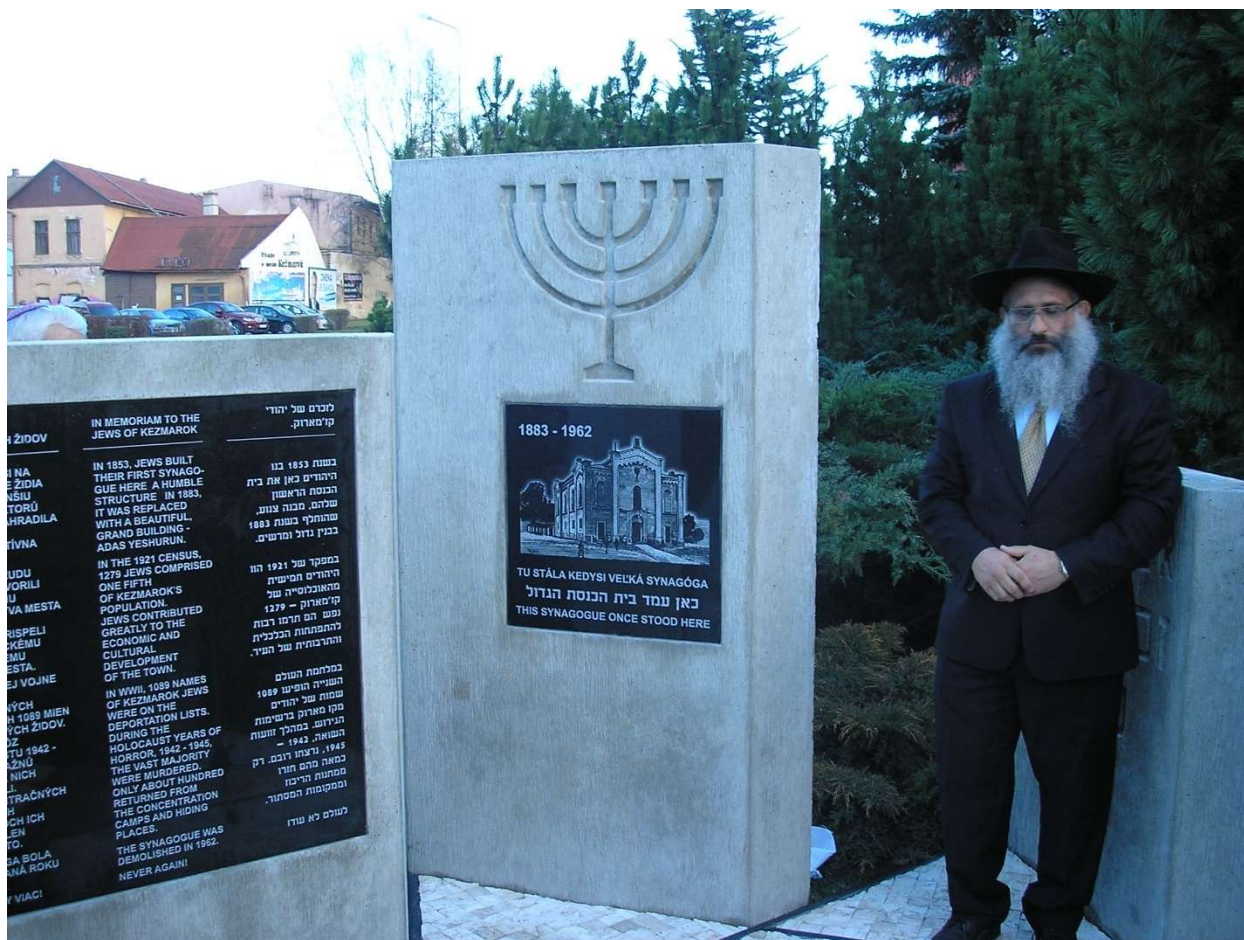
Rabbi Baruch Meyers-Chief Rabbi of Bratislava