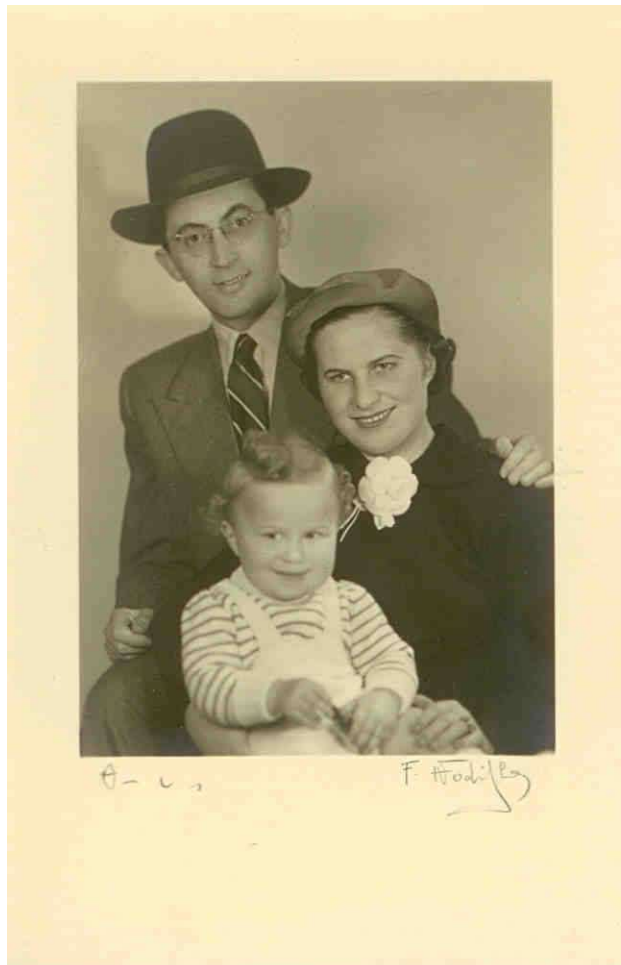
15- My parents and me

In April 1953 we moved to the United States.