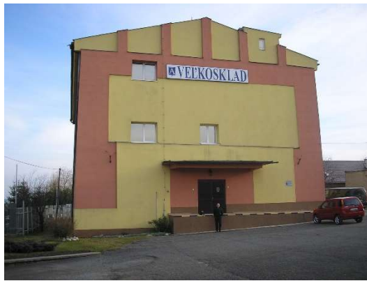
Figure 13- HUNCZDORF-FORMER SHUL BUILDING