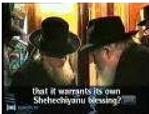
Figure 22-Kezmarker Rav with Lubavitcher Rebbe