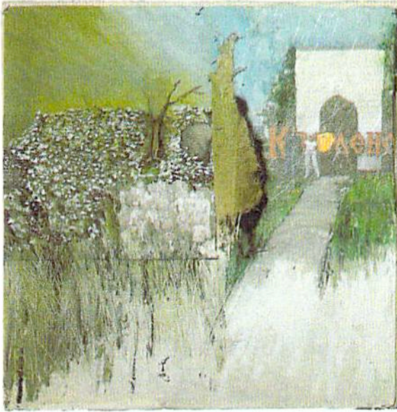
we who are the remnants