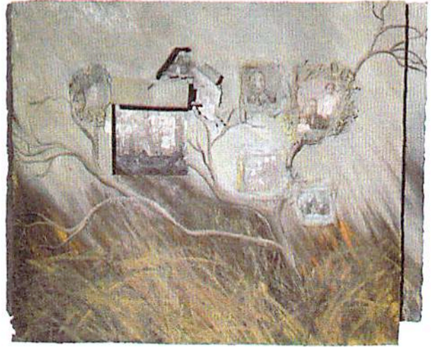
trees are witness

stories and photographs, through ritual and celebration, through prayer and custom.