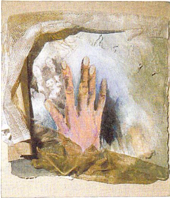
eternal presence of absence I