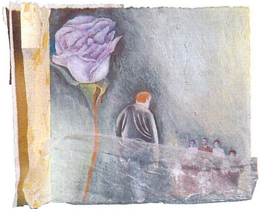
reconstructing the story I

It is the lost world of my mother and father, my grandmothers and grandfathers, that I wish to capture, to honor, and to preserve. It is a world that was very much a part of my life growing up, but one that I never really inhabited. It was an absence whose presence was felt daily. The memory of that world is not ours, but it belongs to us. It has been passed down to us through