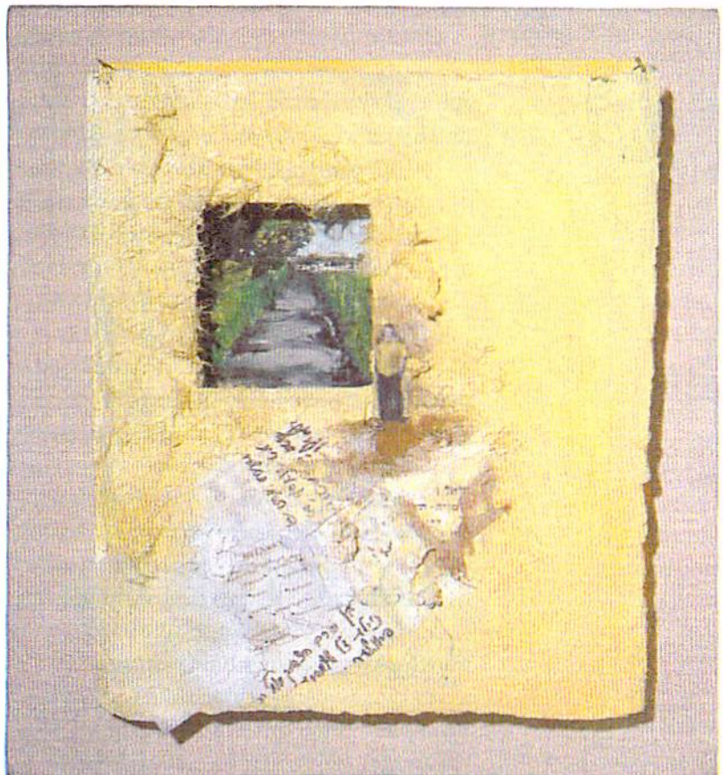
reconstructing the story II