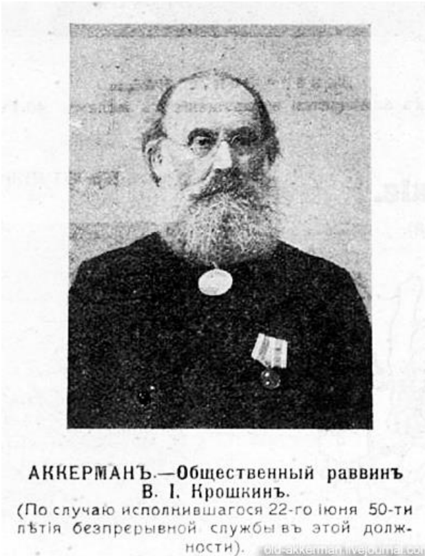
AKKERMAN - Public Rabbi V.I. Kroshkin. (On the occasion of the 50th anniversary of continuous service in this position on June 22).

The plan for the construction of a new Akkerman Jewish Hospital was approved. Soon a new building went up on the corner of Izmailskaya and Evreiskaya streets. During the Second World War it was destroyed and the educational building of GPTU-10 is now built on its foundation.