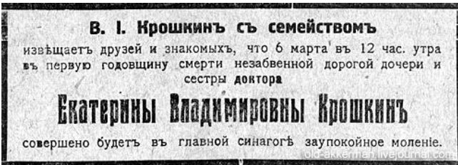
"Ackerman Word", March 5, 1917