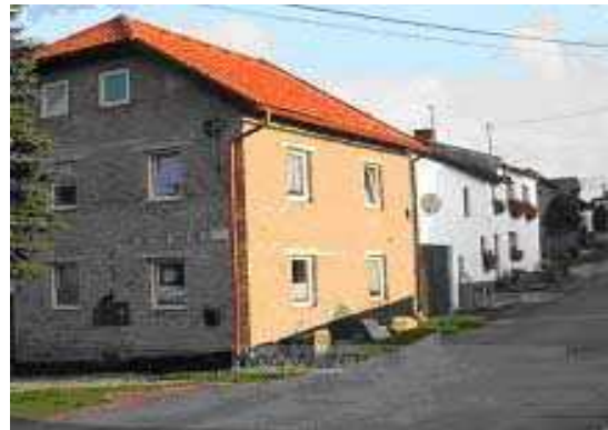
synagogue - old picture, house no.83