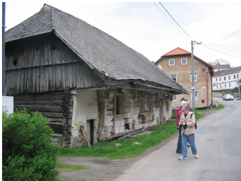
remnants of former Jewish quarter

The first Jewish families settled in abt. 2 nd half of 17 th century. In 1702 six percent of families in Langendorf were Jewish. About 20 Jewish families lived throughout the 18 th century, in 1849 it was 36 families (210 people). In 1837, abt. 26 houses were owned by the Jewish owners. What was their profession? Mostly merchants, one tabaktrafikant, few were distillers.